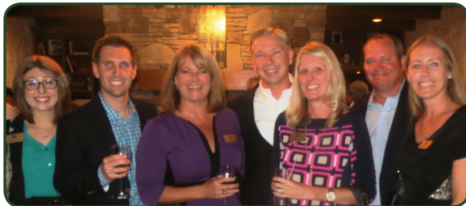
B&C staff and spouses enjoy a great night at the Alhambra.

On Thursday, August 11th, we took a break from our busy summer and headed to Alhambra Theatre & Dining to catch “Smokey Joe’s Cafe”! Over 80 of our clients joined the B&C Financial Advisors staff for an evening of great music, food and socializing.